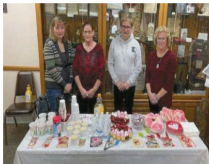
The Vibrancy Committee provided cookies & cupcakes for Fellowship after mass February 12

Feet First Clinic - Call Helping Hands to set up an appointment. 320-746-9960.